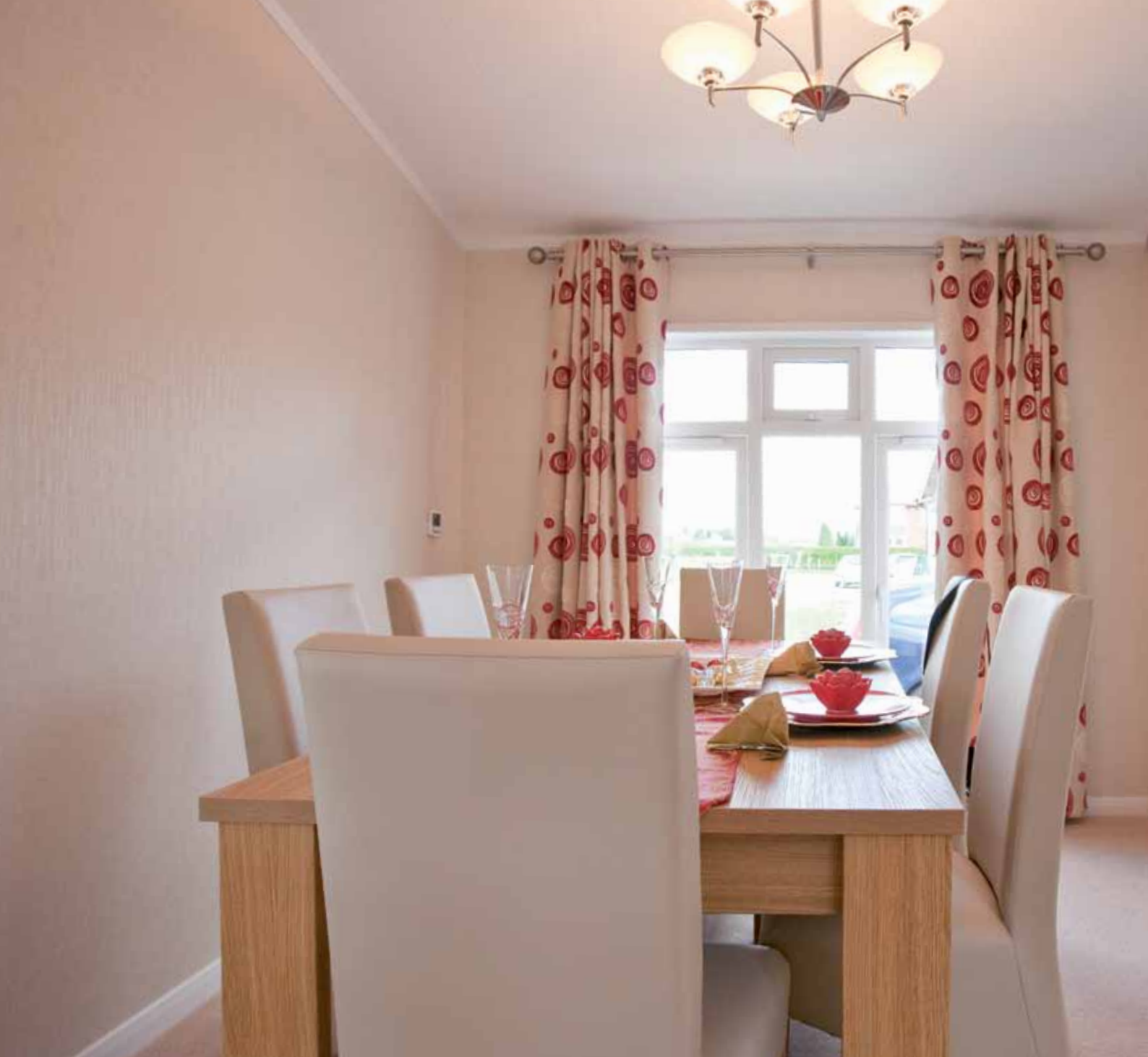
The Pembroke 40 x 20